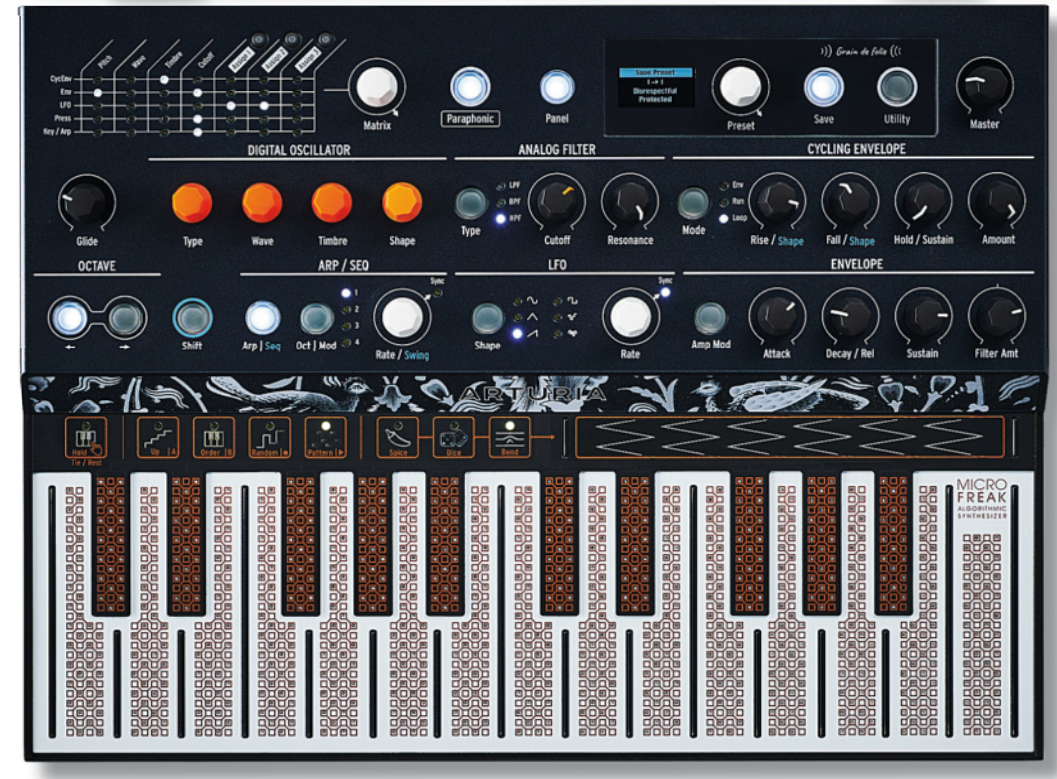
INS & OUTS 1/4" mono output, CV/ Gate Out, Clock In/Out, MIDI In/Out. Powered by 12V DC Power or USB